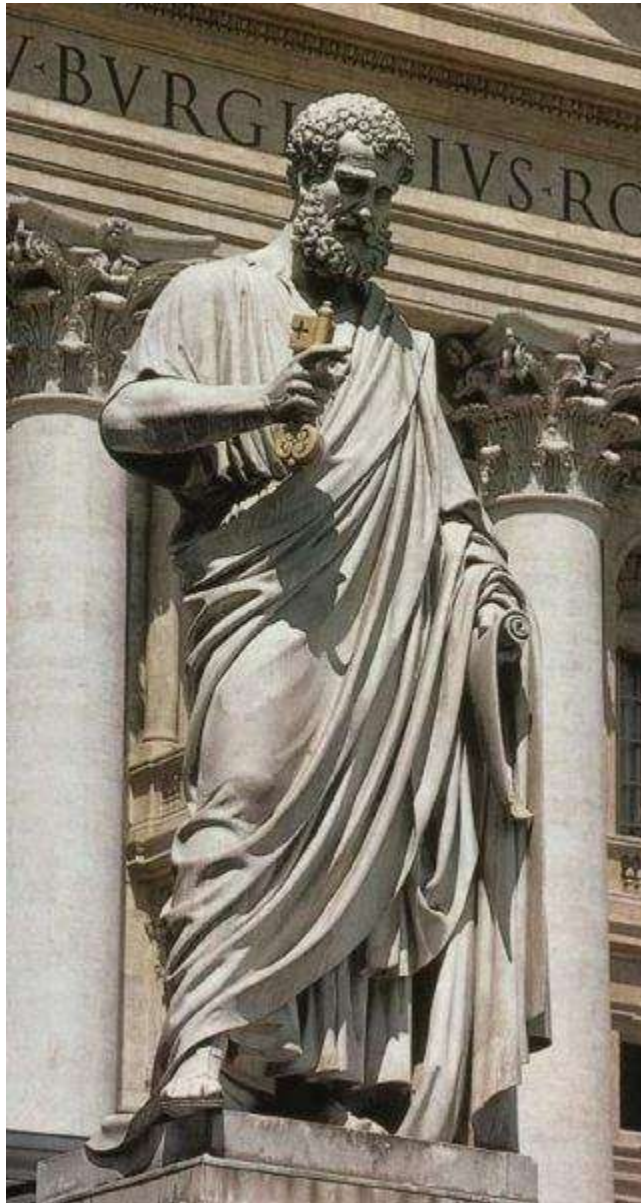
Giuseppe De Fabris – Statue of St. Peter (1840) St. Peter's Square, Vatican City ( saintpetersbasilica.org )