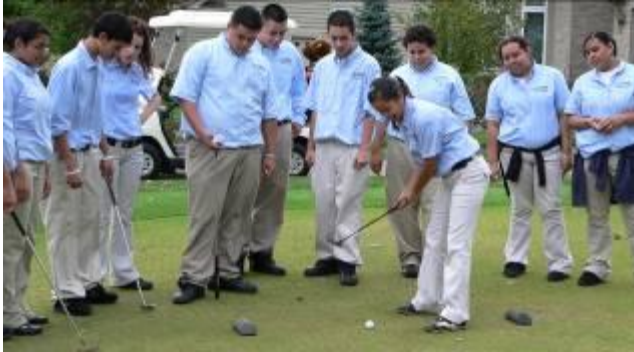
Golf Outing in 2006